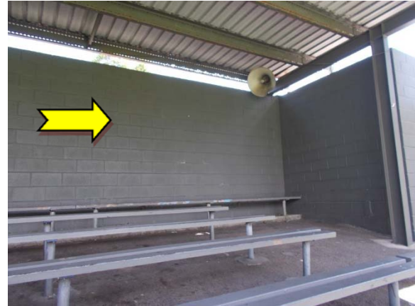
Photo 2. Exterior, throughout, walls – suspected lead-containing dark green upper paint system.