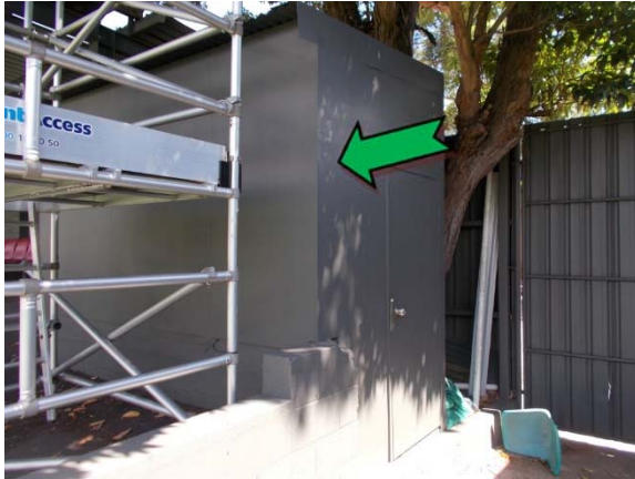
Photo 1. Exterior, shed, throughout, external walls – non asbestos-containing fibre cement sheeting.